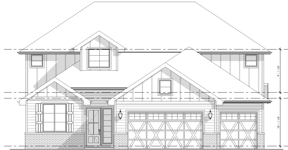
Front Elevation - (3327 SF.) 1/4" = 1'-0"